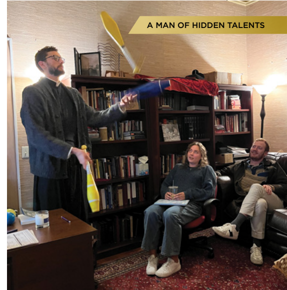
A MAN OF HIDDEN TALENTS

“Through these leisure activities and events like weekly Sunday Suppers, University Catholic invites students to enter deeper into their relationship with the Lord,” he says.