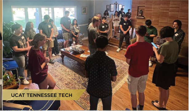
UCAT TENNESSEE TECH