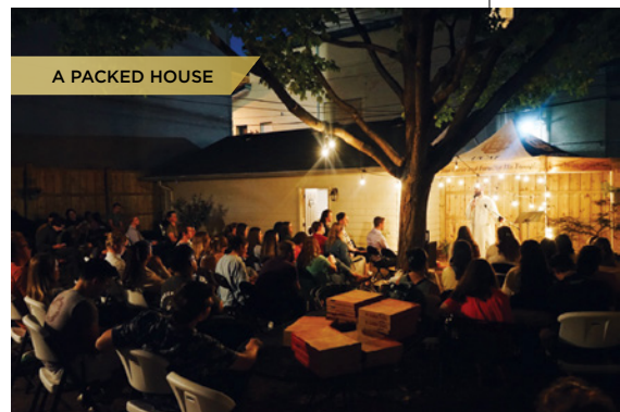
A PACKED HOUSE