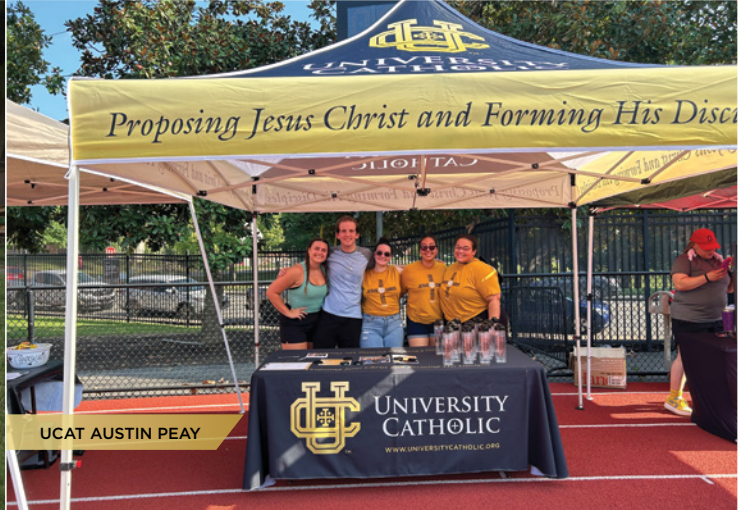
UCAT AUSTIN PEAY