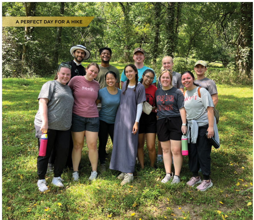
A PERFECT DAY FOR A HIKE