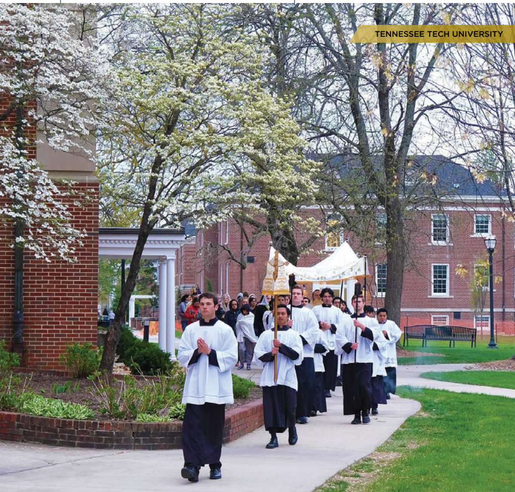
TENNESSEE TECH UNIVERSITY